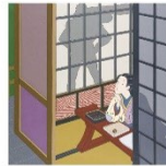
ENGLISH AND LANGUAGE ARTS