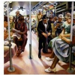
SCIENCE AND TECHNOLOGY