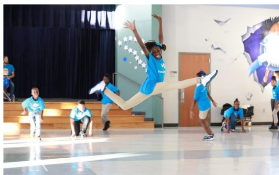
Figure 2 - Photo courtesy of Wallace Foundation

Study of arts education in Houston finds school engagement and student behavior improve—and test scores don't decline.