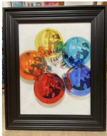
Figure 1 - Image courtesy of WHIZ FOX-5

Local High School Student's Art to be Displayed in Washington D.C.