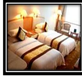
lǚ guǎn 旅馆 (hotel)