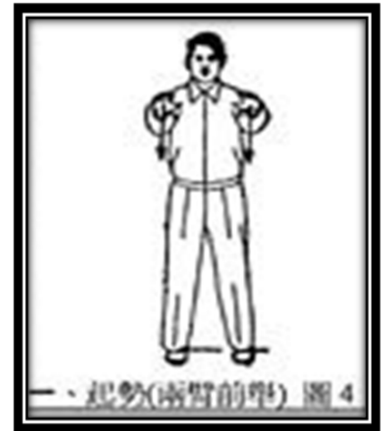
xià 下 (down)