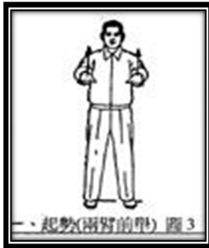
shàng 上 (up)