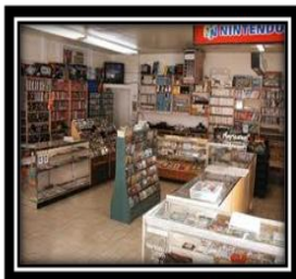
shāng diàn 商店 (store)