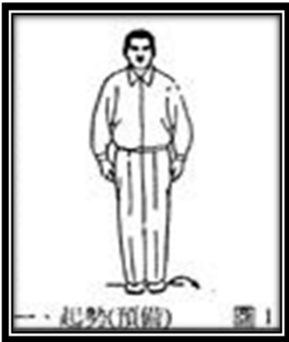
yù bèi 预备 (get ready)