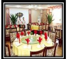
cān tīng 餐厅 (restaurant)