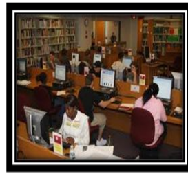
tú shū guǎn 图书馆 (library)