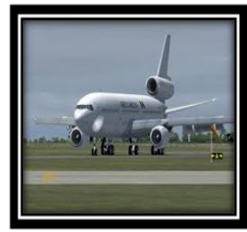
fēi jī chǎng 飞机场 (airport)