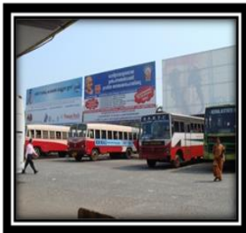
chē zhàn 车站 (bus/train station)