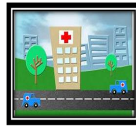
yī yuàn 医院 (hospital)