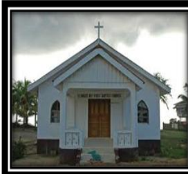
jiào táng 教堂 (church)