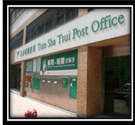
yóu jú 邮局 (post office)