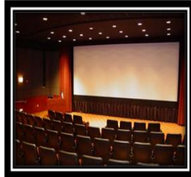
diàn yǐng yuàn 电影院 (cinema)