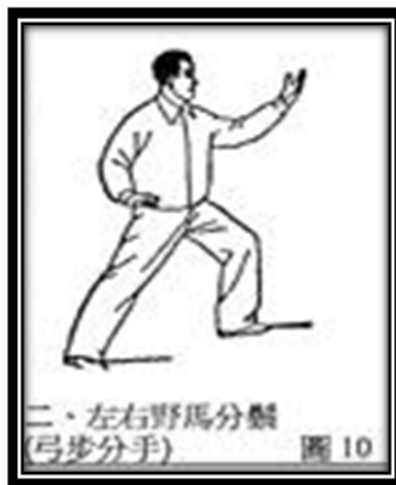
yòu 右 (right)