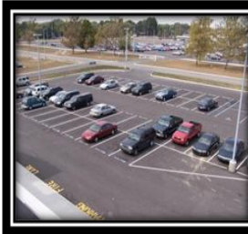
tíng chē chǎng 停车场 (parking lot)