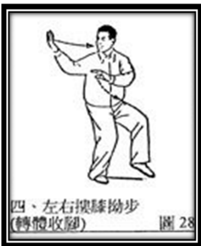
zuǒ 左 (left)