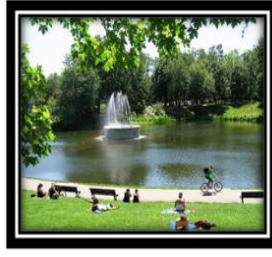
gōng yuán 公园 (park)