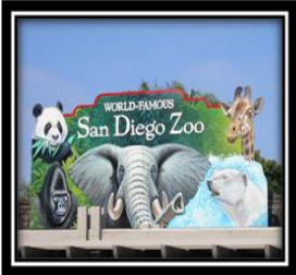
dòng wù yuán 动物园 (zoo)