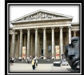
bó wù guǎn 博物馆 (museum)