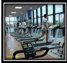
tǐ yù guǎn 体育馆 (gym)