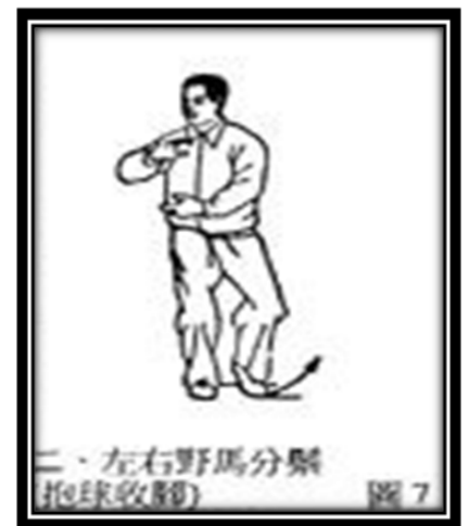
zhōng 中 (in the middle)